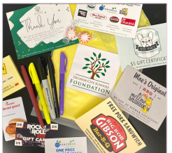
DCS Institute Day

We are proud to provide funding for furniture that will go into the new building at the Career Academies of Decatur. These furniture pieces will provide multiple functions for mixed use spaces and that's a major plus! When parent or industry nights are hosted there, they have the ability to change the room to accommodate the need.