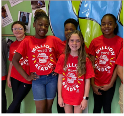
Million Word Challenge

We love celebrating reading success! Students who read 1 million words during the school year are rewarded with a Million Word Reader t-shirt. 3rd through 8th graders who exceed 1M words not only receive a t-shirt, but also a gift card! This year we were fortunate enough to have 140 students read 1 million words or more and a student from Austinville Elementary and one from Austin Middle School read 5 million words!