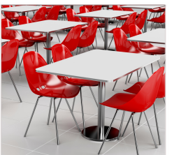
Career Academies Furniture

Rollin' into STEM is a new DCS initiative. This mobile STEM lab or "STEM Bus" will serve our 12 elementary schools and local neighborhoods. It will have the capacity to provide learning opportunities for 45 students at a time. Our goal is to expose students to enhanced STEM education and make learning come to life through hands-on activities.