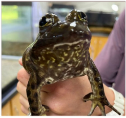
Wetland's Edge Environmental Center

With an increase of automotive manufacturing in Alabama, we know continued investment in career technology is a must! This year we were thrilled to secure funding for the Career Academies of Decatur's Automotive Academy. These funds provided them the opportunity to purchase much needed tools and supplies.