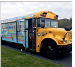
DCS STEM Bus

March Madness is a competitive reading initiative of the Million Word Challenge. We recognize the top class at each of our elementary and middle schools. The class with the most average words read per student, earn a pizza and cookie party. It is tons of fun and these students enjoy the friendly competition and celebration (while increasing their reading proficiency)!